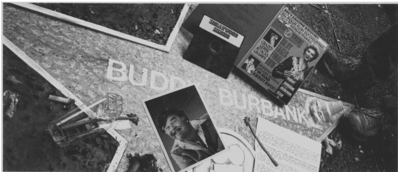
Featured in every package of HOLLYWOOD HIJINX : your HOLLYWOOD HIJINX disk; a star-studded copy of TINSELWORLD magazine; your Aunt Hildegard's will; an autographed photo of your Uncle Buddy; and a lucky palm tree swizzle stick.

Vampire Penguins. A Corpse Line. Meltdown on Elm Street. Who could forget these classic Hollywood movies produced by your uncle, Buddy Burbank? But his greatest masterpiece has yet to be experienced... HOLLYWOOD HIJINX , starring you!